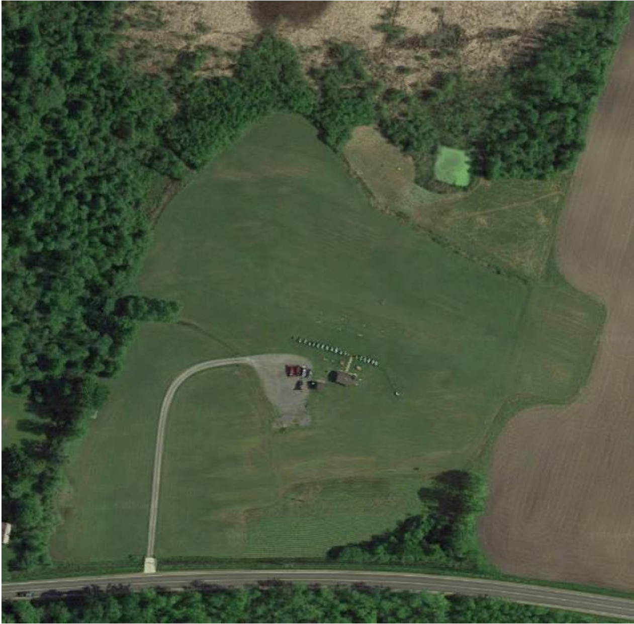
STARS Field Satellite photo